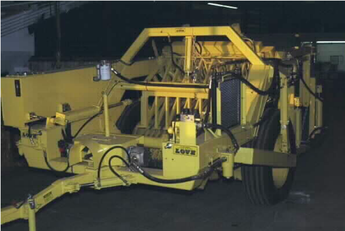
LEFT FRONT VIEW, BASIC MACHINE PACKAGE