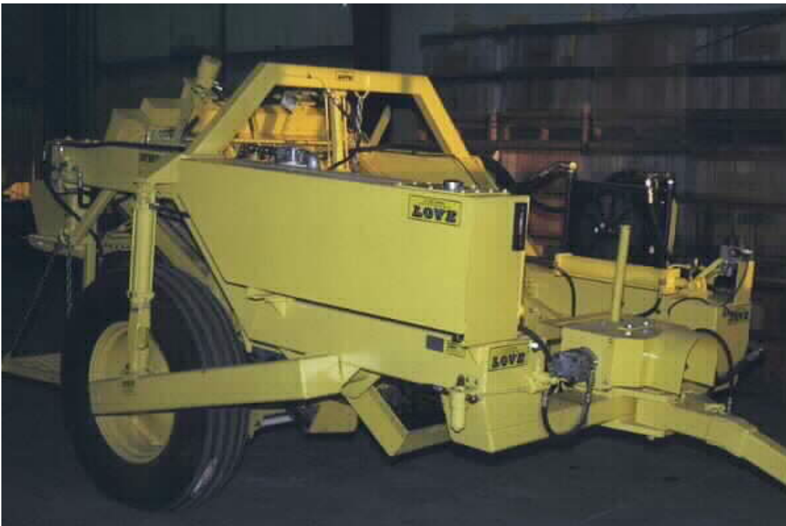
RIGHT FRONT VIEW, BASIC MACHINE PACKAGE