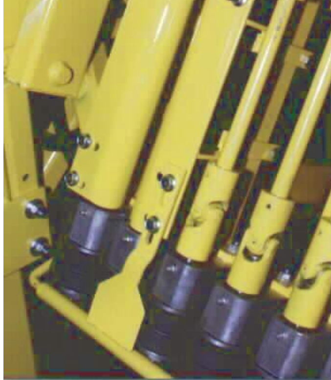
SHIELDS AND GUARDING