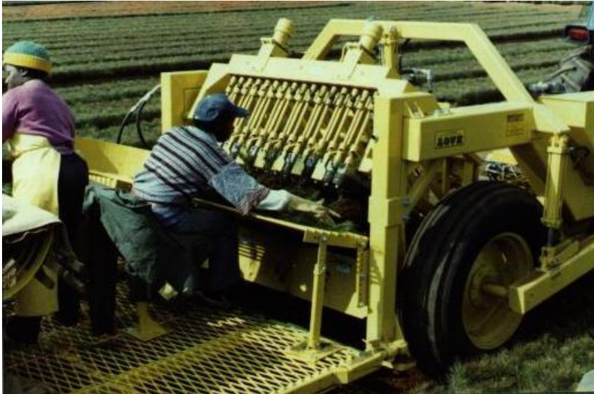
OVERALL VIEW OF PICKUP UNIT IN OPERATION

Belt style pickup system consisting of two (2) wide mating belts per row, adjustable belt speed, hydraulically driven. Universal joint drives, sheave scraper at each sheave, all idler sheaves are needle bearing, relubricable. Three idler assemblies at each belt carrier nose, row compression bolts for added seedling grip and side stabilizers are added to the standard B721001 package. Patented gradual contact, adjustable speed, balanced motion oscillating mycarta beater Root Cleaning System with 48" beaters and Timken bearings. Removable guarding of root shaker drives components. Manpower requirement: None.