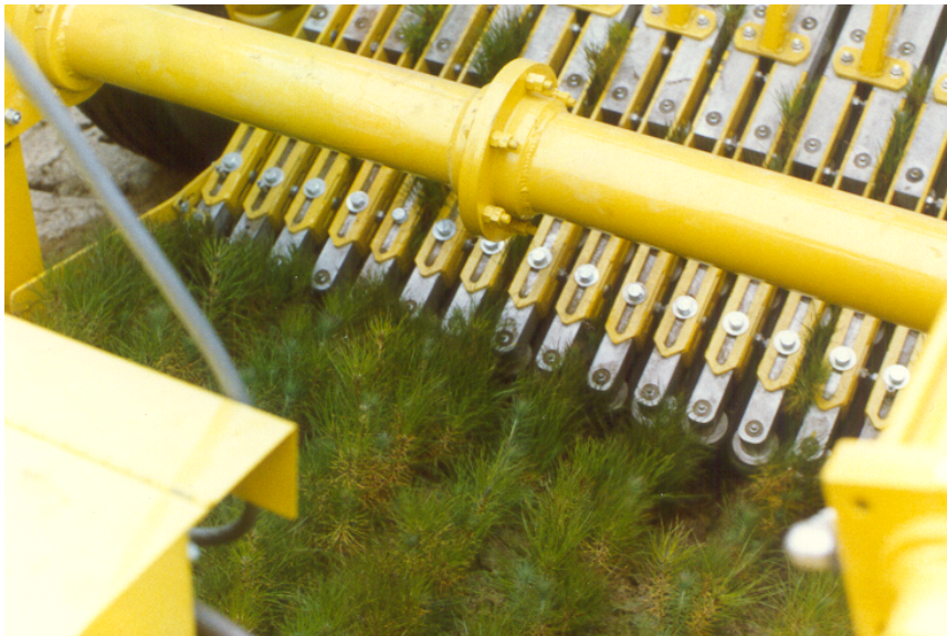
FRONT VIEW OF PICKUP UNIT IN OPERATION